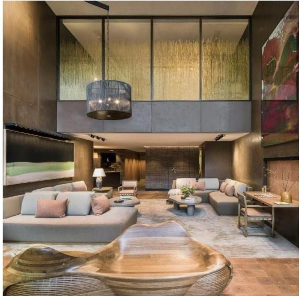
The properties at Holland Park Villas have been designed for an international market