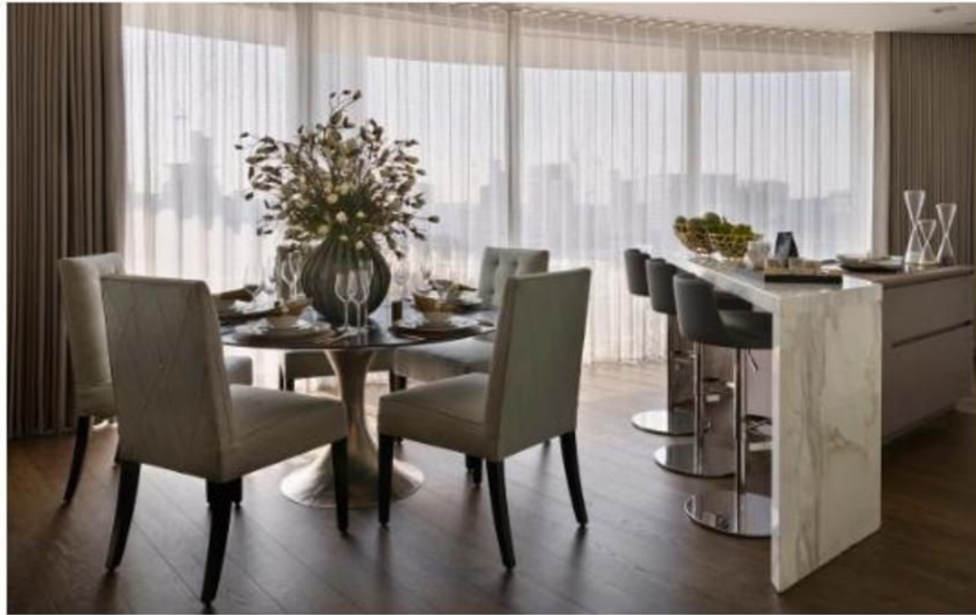
The Riverwalk development features London-inspired decor by Alexander James Interiors

While Sibley agrees there are some cultural differences - Russian buyers typically bring their art collection with them, so they are often drawn to show homes designed around large artworks - much else is international, such as the demand for lock up and leave convenience, the appreciation of the very best fabrics and furnishings and the ease of being able to buy a dressed show home exactly as seen, down to the teaspoons.