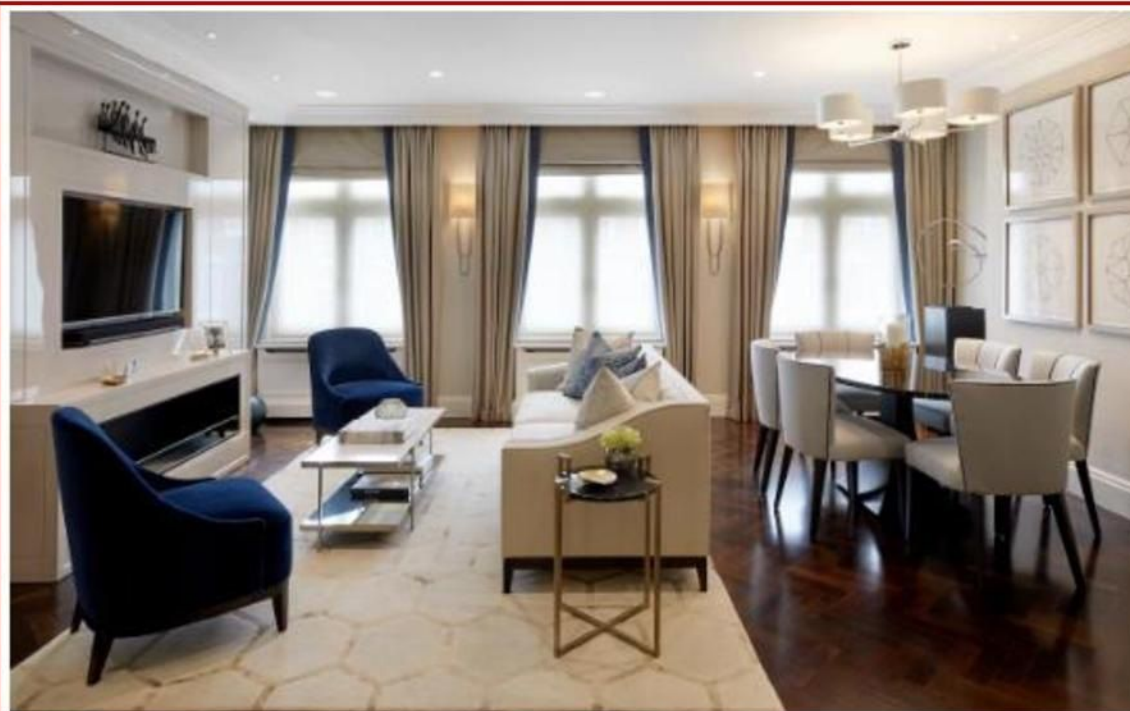
This £4.75m property in Pont Street, London has been designed around the principles of vastu shastra

She adds that in the same way that a ‘New York’ feel can be achieved in a property’s design, “it could be possible to identify key factors that define the expectations of buyers in terms of cultural, local, regional or national influences.”