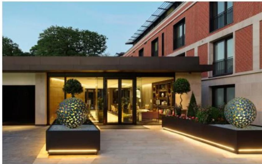
Buxmead in Hampstead, north London, which has homes designed to appeal to different nationalities