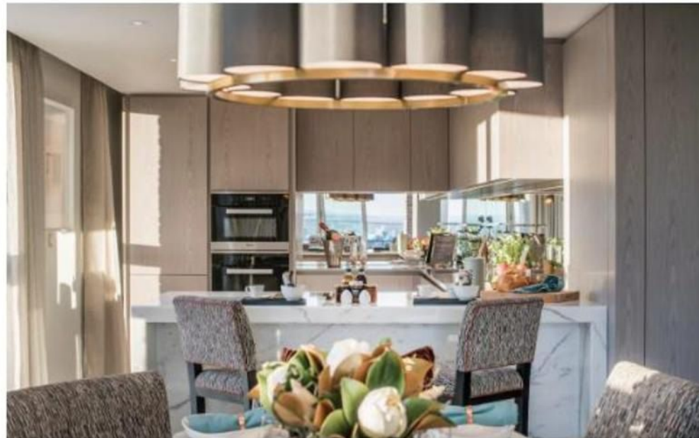
Apartments at London's Landmark Place have been specifically designed to attract international buyers